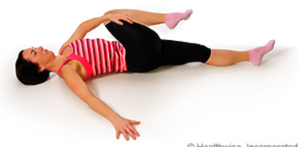
@ Healthwise, Incorporated